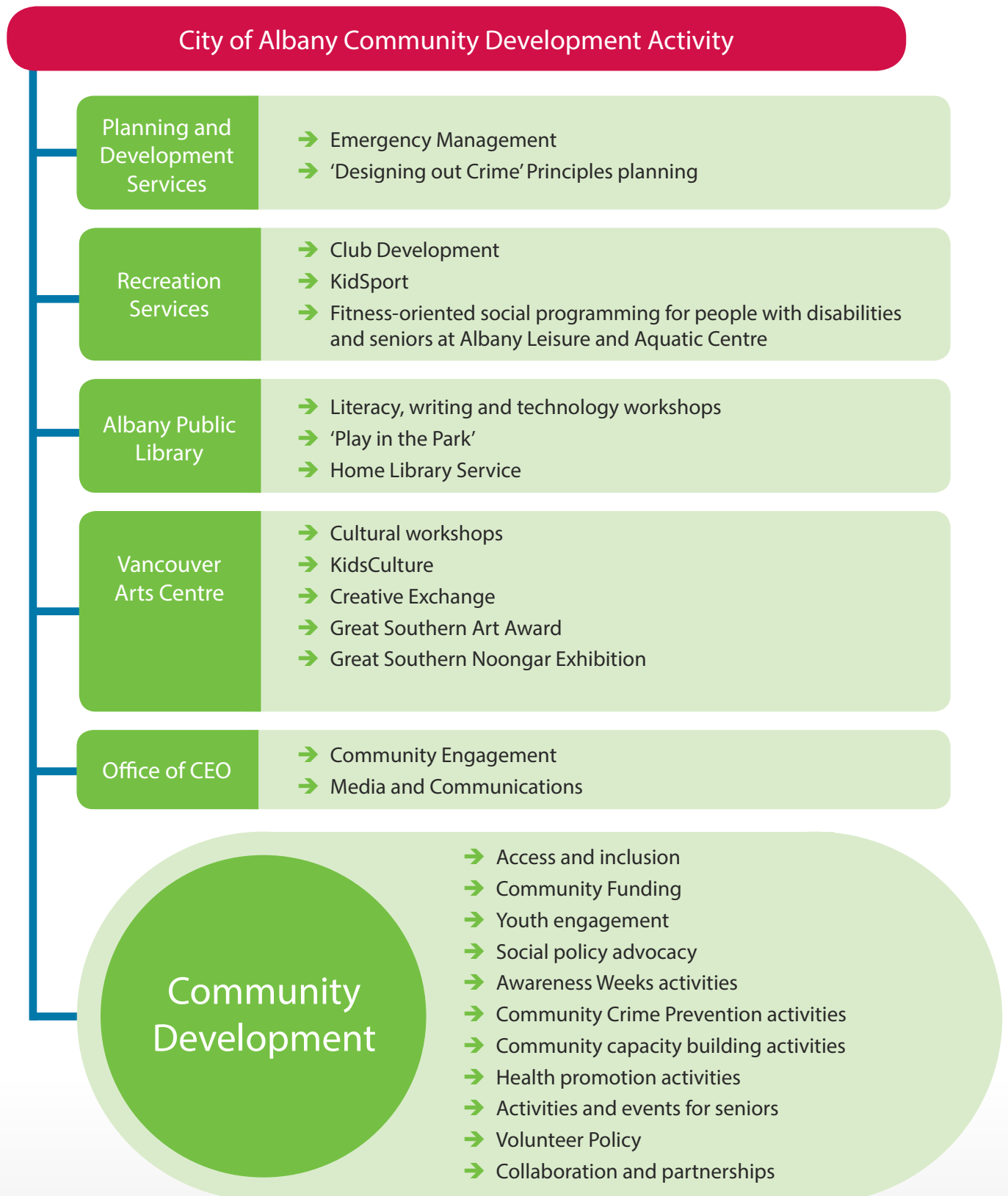
Figure 4: City of Albany Community Development Activity