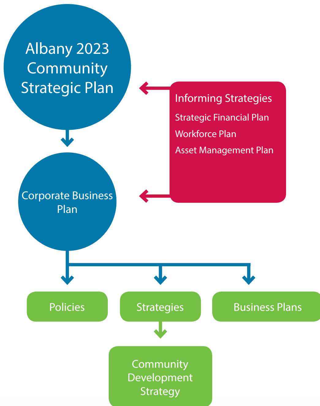
Figure 1: City of Albany Integrated Planning Framework

How this Strategy links to the City's Community Strategic and Corporate Plans is illustrated in Figure 1 as follows: