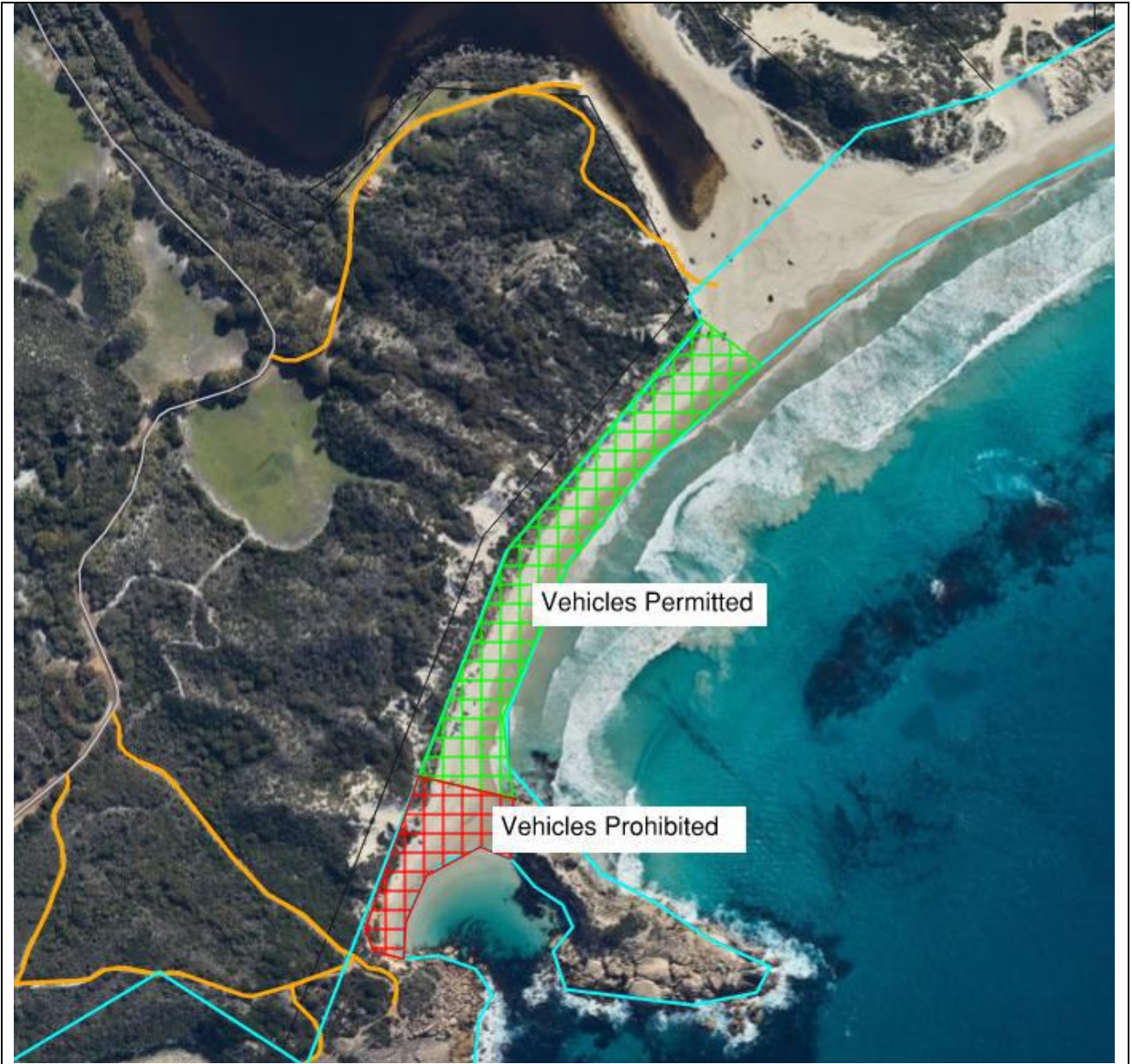
Nanarup Beach – Vehicles Prohibited in the “Lagoon Area” as depicted in hatched red.