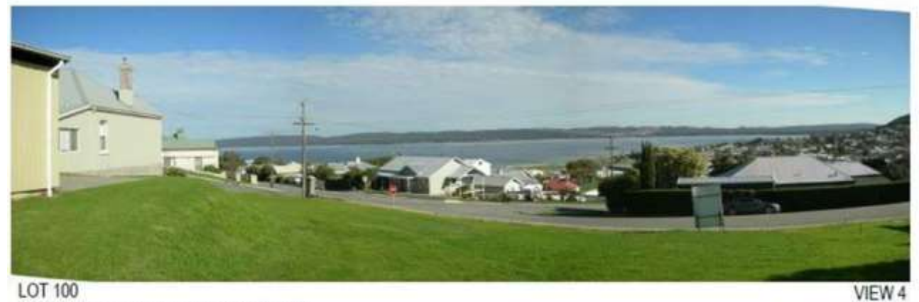
GREY STREET EAST - HARBOUR VIEW