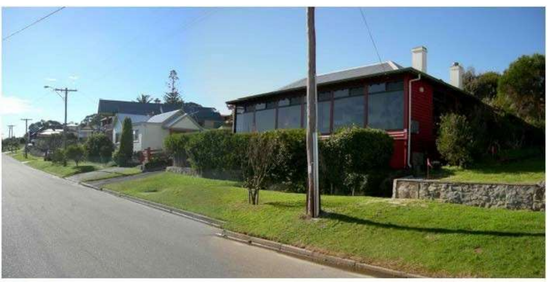
ROWLEY STREET VIEW 2