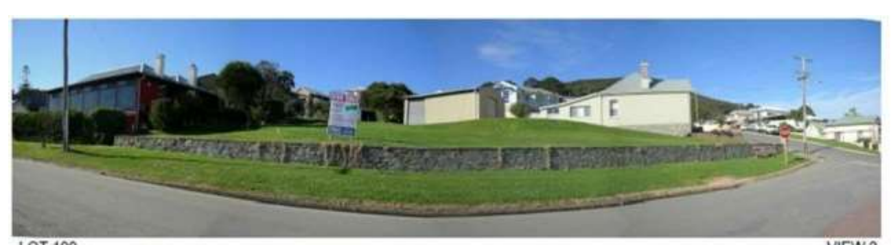
LOT 100 ROWLEY STREET / GREY STREET EAST CORNER