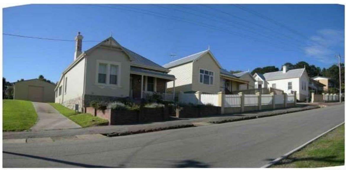
GREY STREET EAST - STREET VIEW

11. The existing houses in Grey Street East and Rowley Street present a consistent pattern with the houses presenting a strong traditional street front. Refer to Street Views - Attachments 5, 6 and 7 below.