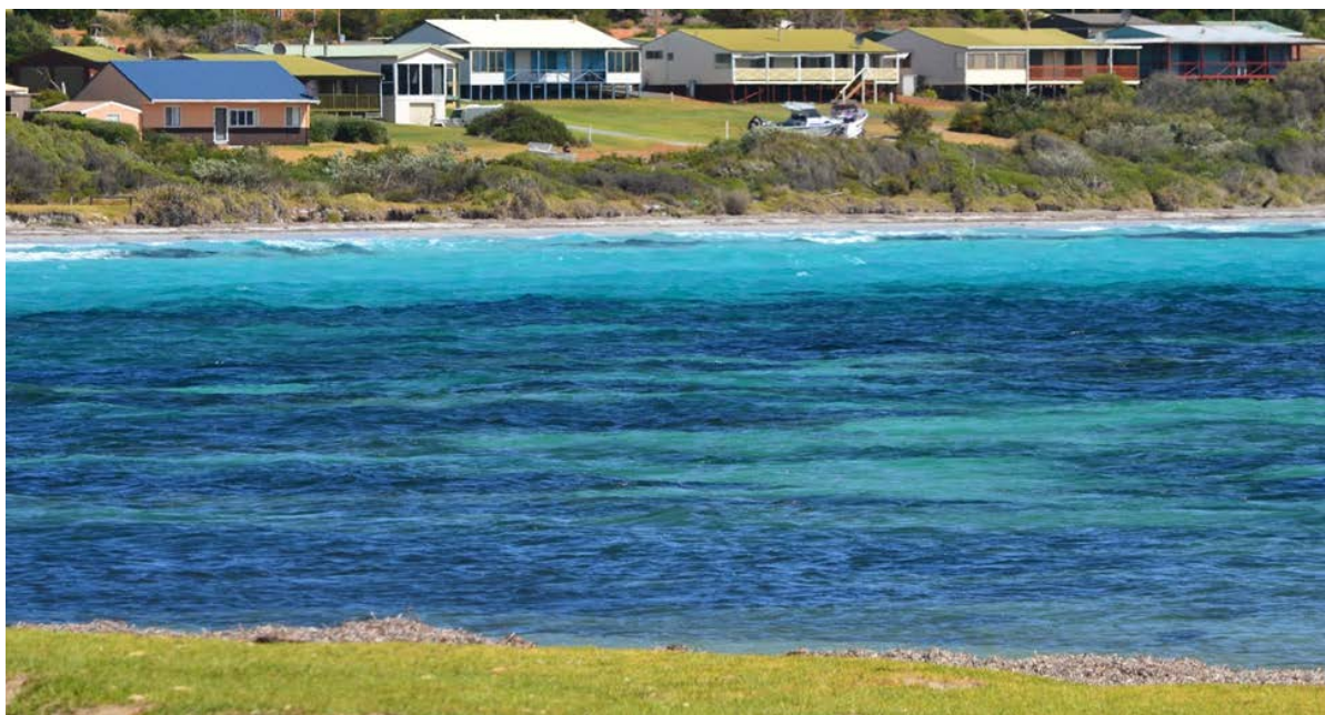
Figure 2: Cheyne Beach Character