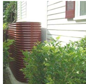
Figure 2 – Stormwater buffer system detail