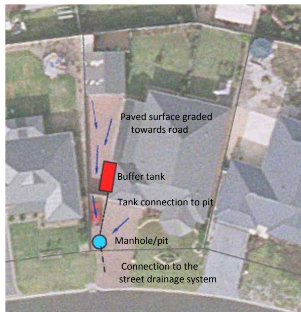
Figure 1 – Stormwater buffer system layout

There are several options that can be used in achieving the City of Albany's detention requirements. In sandy soils underground soakage is appropriate. For all other areas we recommend the use of a rain water tank with a stormwater buffer and an overflow to the street drainage system, see figure 1.